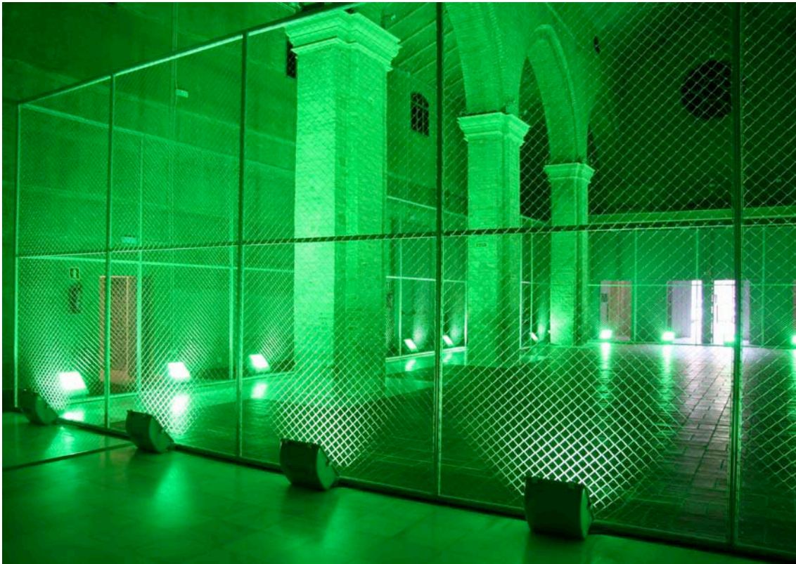
Espacio Iniciararte para la Creación Contemporánea. Seville, may 2008.

*(...) By closing the space what happens is that “the space appears”. The fence creates a physical, but not a visual boundary. The space of the room filled with green light is cut by the physical limit of the fence. The spectators are restricted in their movements. The space that would normally be used by them is now closed and only visually accessible (...)