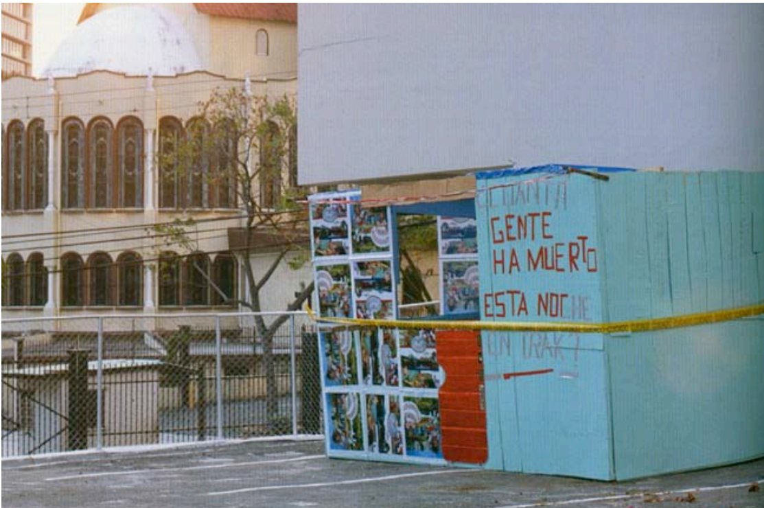
Plate 2.2 Jesús Palomino. Vendors and Squatters (detail), 2003.