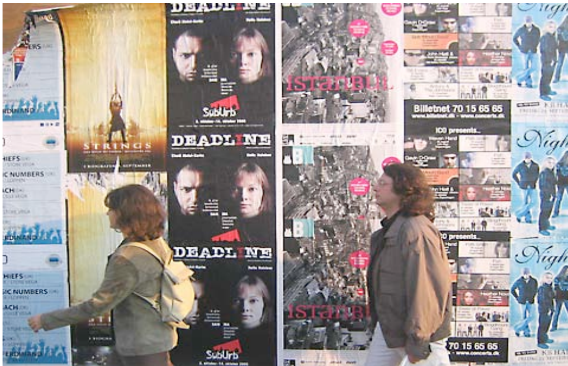
Plate 4.2 SUPERFLEX & Jens Haaning. 1000 Istanbul Biennial Posters (detail), 2005.