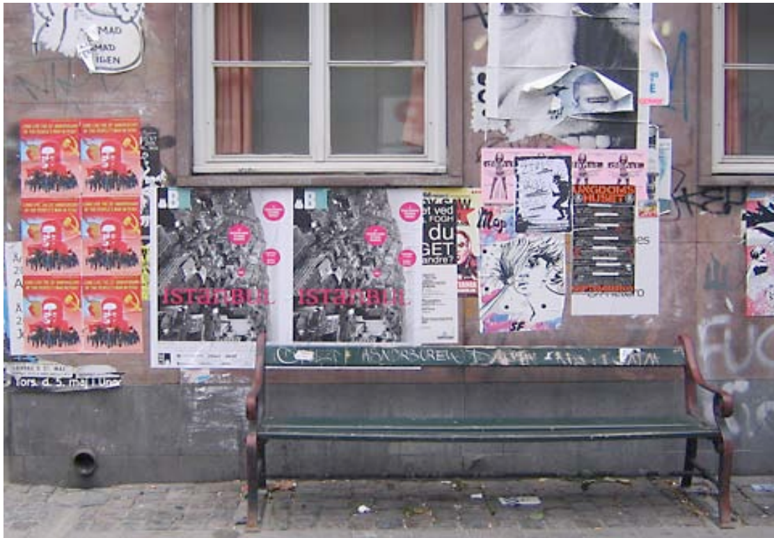
Plate 4.1 SUPERFLEX & Jens Haaning. 1000 Istanbul Biennial Posters (detail), 2005.