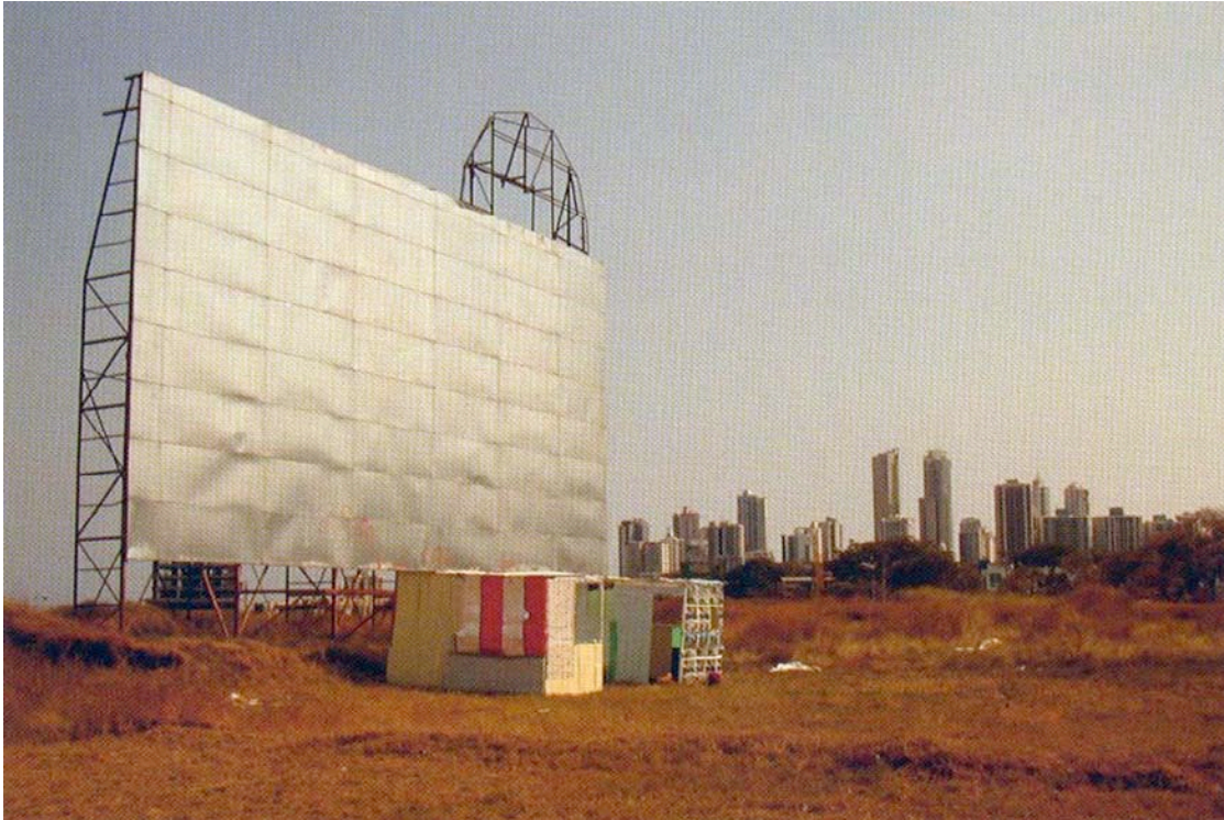
Plate 2.1 Jesús Palomino. Vendors and Squatters (detail), 2003.